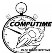
Clerk of Course - Alistair Kinsella